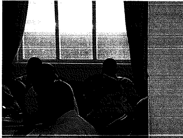
Participants in workshop session

In general, the following comments were then raised by the participants: